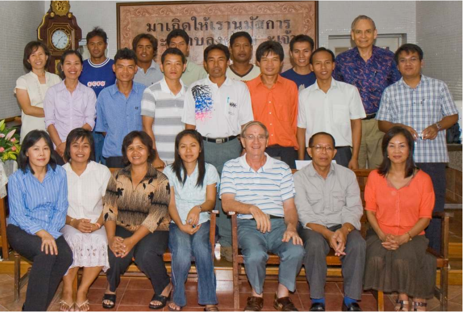
Delegates to the Annual Meeting of the CBA, Thailand—see page 3