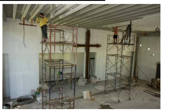
Above -Inside view of the building under construction

Our present thinking is to sell our unit here in Nundah early January, and buy a house on the south side of Brisbane. We really thank you once again for your prayer support over the past year, and covet your prayers for the Lord's continued guidance.