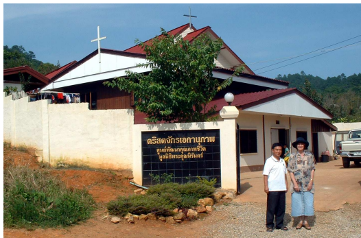
Our visit to Mae Hae in 2004

through Bangkok in October and reported that the Lord has continued to do amazing things there!! Between 100 and 200 now worship regularly every Sunday. They have had to build a bigger building to accommodate the increased numbers.