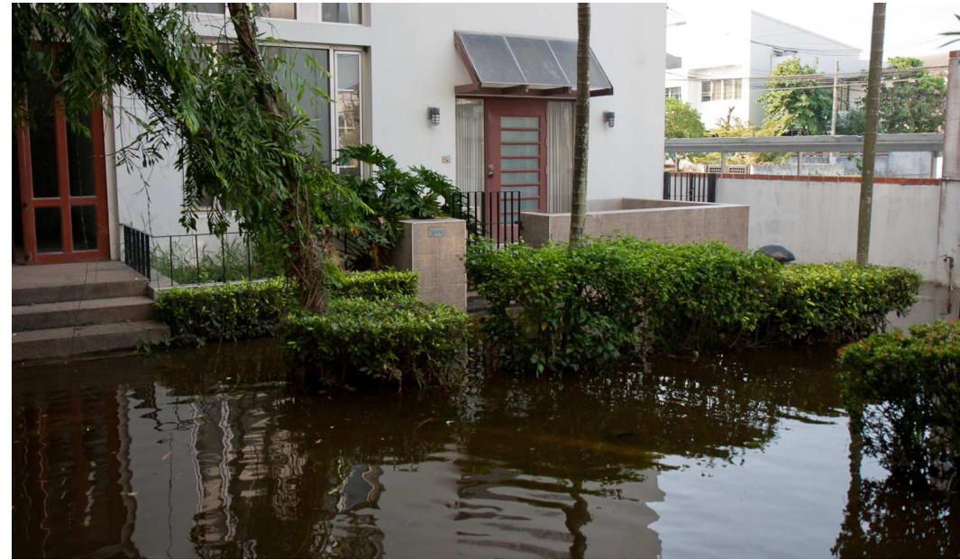
The first day of the flooding before it entered our condo— more on the flood inside