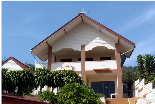
The original church building