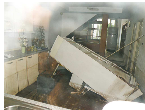
Our kitchen photographed from outside the window

The Word of God exhorts us to pray for governments and those in authority over us.