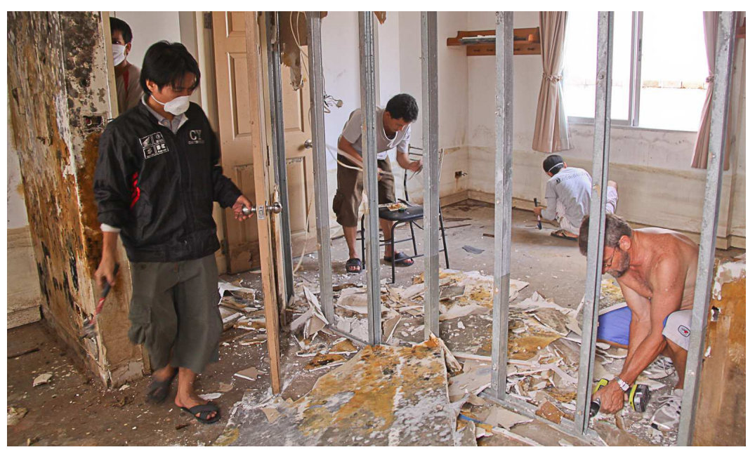
Restoration in progress—members from our Aussie and our Thai churches working together