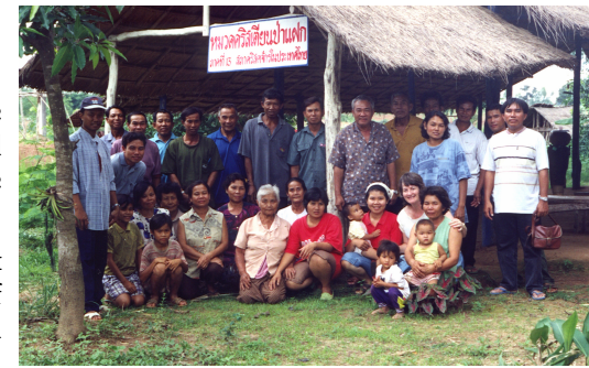
Group at satellite church, Sriwilai

On the Saturday, quite a large group of the fellowship joined us for breakfast, took us out for some sight-seeing and then had lunch with us at a satellite church in the