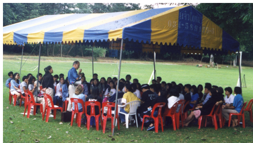
Seminar at CCC Camp

Each of the CCC workers must be university graduates themselves, and then complete a nine month full time Bible study and training program in preparation for their ministry. They are also responsible to raise their own support - they live by faith.